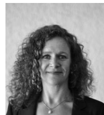
SOPHIE IN 'T VELD, VICE CHAIR ALDE, MEMBER OF THE EUROPEAN PARLIAMENT