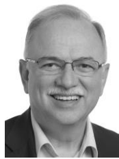
DIMITRIOS PAPADIMOULIS, VICE-PRESIDENT FOR GENDER EQUALITY, GUE, EUROPEAN PARLIAMENT