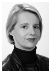
HELGA STEVENS, VICE CHAIR ECR, MEMBER OF THE EUROPEAN PARLIAMENT