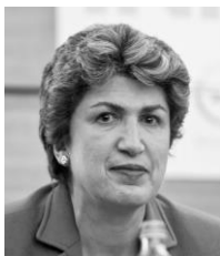
MARIA JOÃO RODRIGUES, VICE CHAIR S&D, MEMBER OF THE EUROPEAN PARLIAMENT