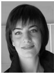
LARA COMI, VICE CHAIR EPP, MEMBER OF THE EUROPEAN PARLIAMENT